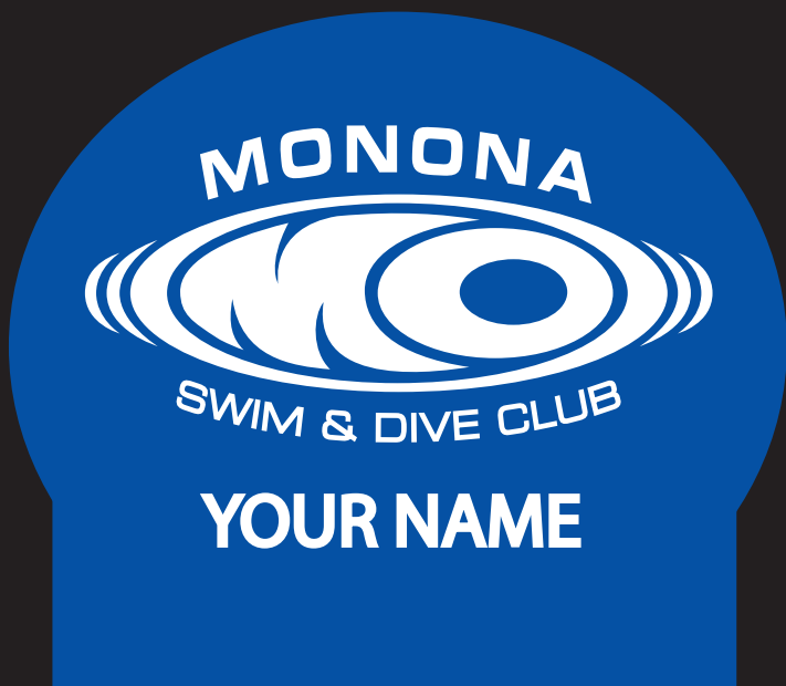
Royal Blue Cap with White Logo